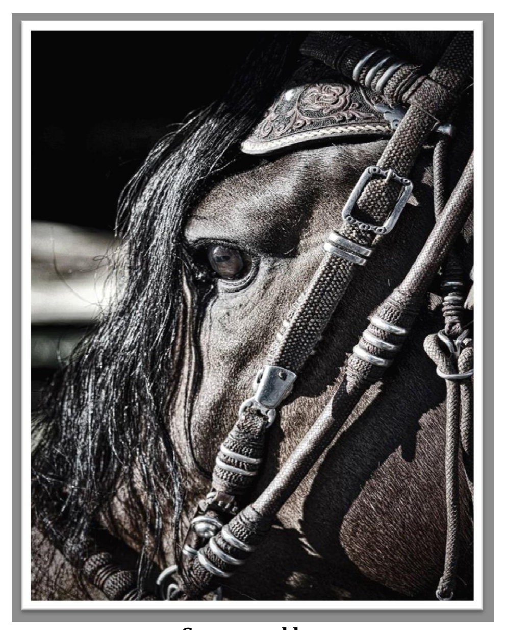
Sponsored by: Peruvian Horse Club of Alberta (PHCA) Peruvian Horse Club of BC (PHCBC)