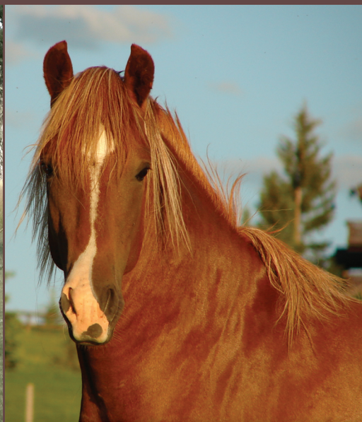
RSTD Trueno Best Bozal Horse of Show at his first show Espejo de Peru x RSTD Donadora (x RDLF Don Alberto)