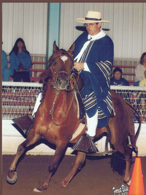
RSTD Valencia++ Cdn National Laureada Pleasure Mare *JJBN Tacubo x Descarada (x Viracocha)