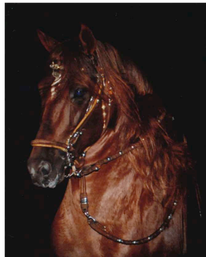
CM Innovación 2002

National Laureado Breeding & Pleasure 9 Best Gaited Awards in Canada US National Best Gaited Horse