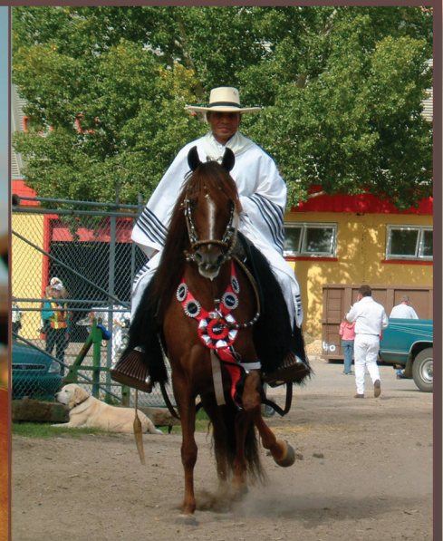
RSTD Madonna++ Canadian National Laureada Breeding Mare RDLF Don Alberto x REC Flor de Oro (x Domingo Real RM)