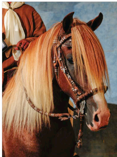
CM Inca Roca 2003

We have been breeding Peruvian Horses since 1974. Some CM horses have SIX generations of our breeding in their pedigrees. Our foundation of Soberano CM bloodlines – the elite of old Cayalti combined with *Piloto – and our program of alternating the bloodlines to provide outcrosses, has consistently produced winners. Horses we have sold have become valuable breeding stock, show horses and companions for their new owners. We can offer our best blood because we have consistent quality, and only maintain around 20 horses at any given time. They are trained in a fear-free program which allows a horse with great brio to also have calm self-control.