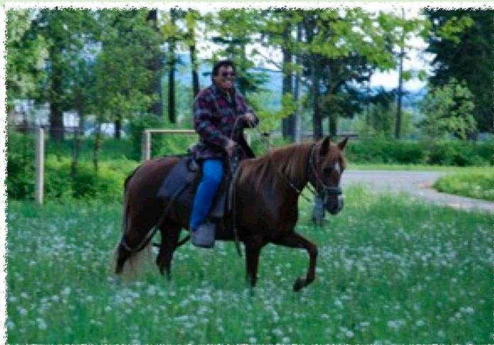
MRA Candela Ch of Ch Breeding Mare PHBC 2010