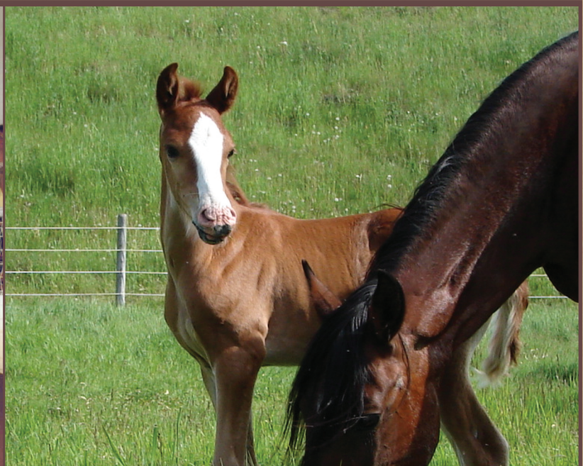
RSTD El Desafiador HdN Coqueton x Encima (x *AV Ultimatum)

OUR RECORD SPEAKS FOR ITSELF CANADIAN HIGH POINT BREEDER 2001, 2002, 2004, 2005, 2006, 2007, 2008