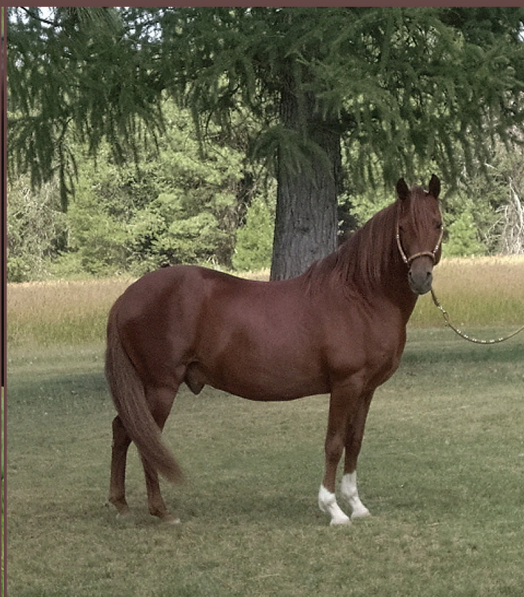
Espejo de Peru+ (owned in partnership with Campbello Peruvians) Cdn National Laureado Breeding Stallion *JRM Mariscal x *JRM Altiva (x JRM Redoble)