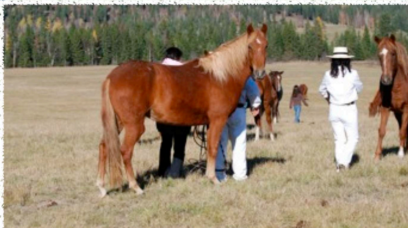
EGR Libertad Best Bozal PHCA 2010