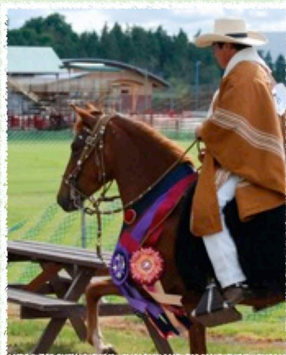
AV Almendra 2008 Can Nat Ch of Ch Breeding Mare. Winner of the Conquistador Cup 2005 & 2006 US Nat. Ch Jr Mare

Proud Sponsor of Professional Belt Buckle