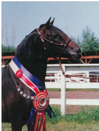
Soberano CM 1979—2002

Champion Breeding Stallion Champion Pleasure Stallion 2 times Best Gaited Horse of Show