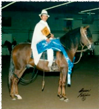
BSP Grandioso 1999 Laureado Breeding