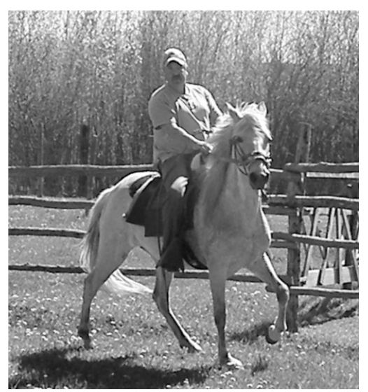
horse before the trail ride.