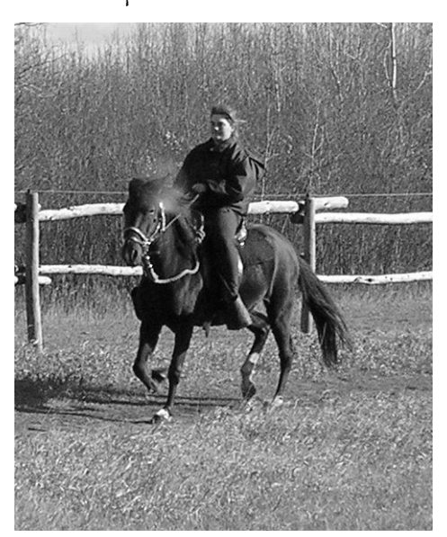
This is Ocaso and although he can show off his brio if the occasion calls for it, he is so quiet, gentle and safe, that he started his career as a beginner lesson horse after only 1 year under saddle. He is now 9yrs old, 15.1hh, and doing fantastic. He continues to help beginners and those with a fear of

Paladín throws strong well gaíted foals with excellent temperament, good size. He is one of the last true blue blood the peruvian breed. Here are some examples of his offspring we have had.