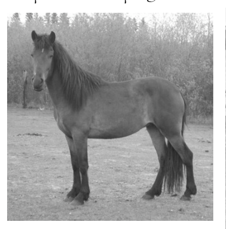
Orion at 3yrs old has big strong bones and is well gaited with lots of brio.